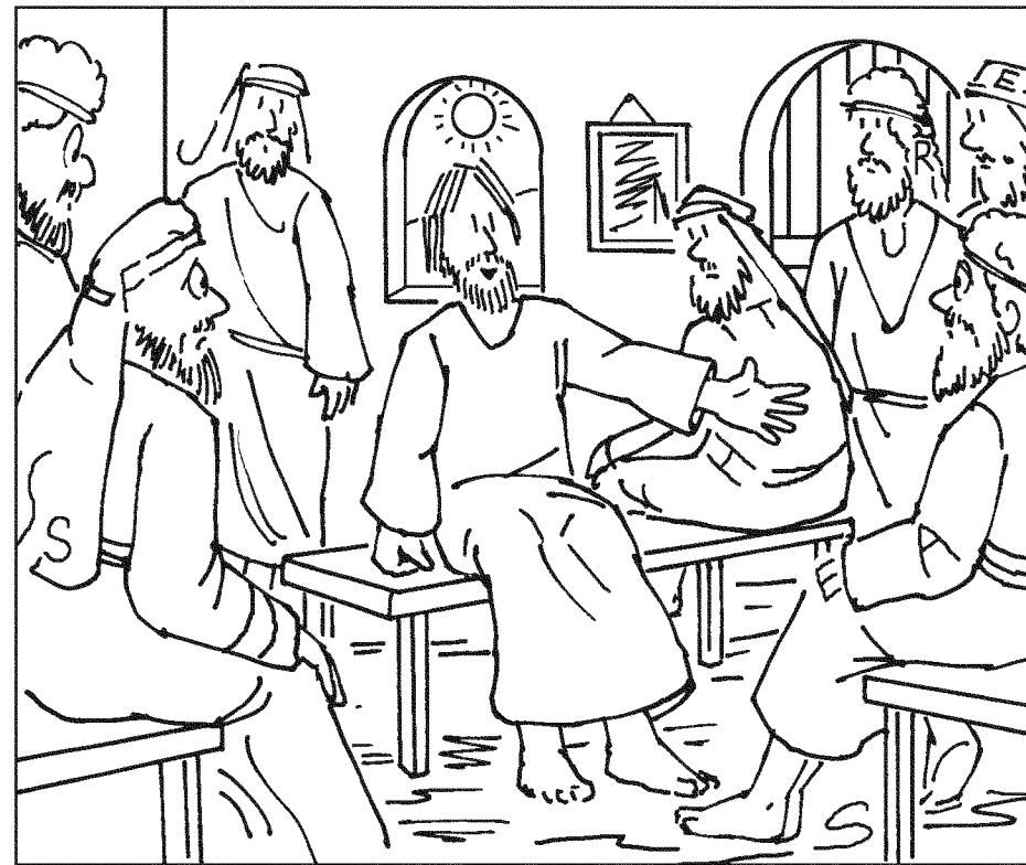
St. Luke the Evangelist

Find these letters hidden in the picture: JESUS FATHER